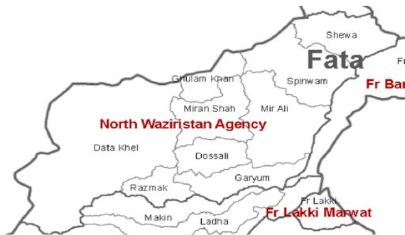
Map 2 – My AOR in North Waziristan Agency

However, jani khels and khaddar khels from the Detta khel area (who had a reputation for violence) became close ally, and were influential in spreading our appeal for peace and harmony.